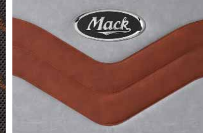
ACCENT — LEATHER