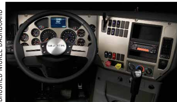
BRUSHED NICKEL DASHBOARD